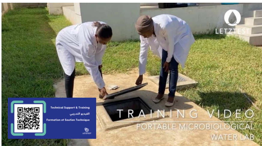
Figure 3 – A QR code in each kit leads you to a training video

Each kit contains a QR-Code that leads to practical training videos . In case of further questions, the end user can also directly and easily contact a LETZTEST technician via the same QR-Code.