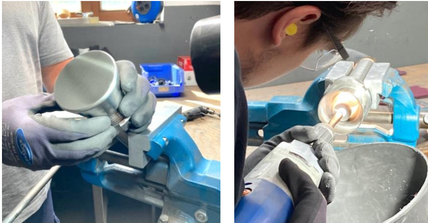
Figure 2 – LETZTEST is simplicity in highest quality.

100% made in Germany. Originating from Letzner Pharmawasseraufbereitung GmbH (now EnviroFALK PharmaWaterSystems), LETZTEST is a company that places great importance on the quality of its equipment. Intermediate production steps and finished products are checked against specified release criteria.