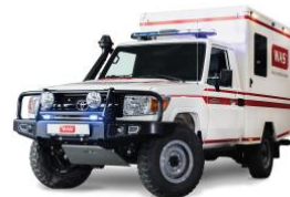
Figure 1 – LETZTEST mobile Water Laboratory Boxes are a ground-breaking solution for remote water laboratory projects. Attachable to vehicles for on-the-go applications.